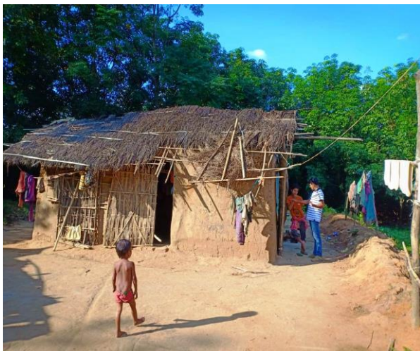
Earlier condition of House