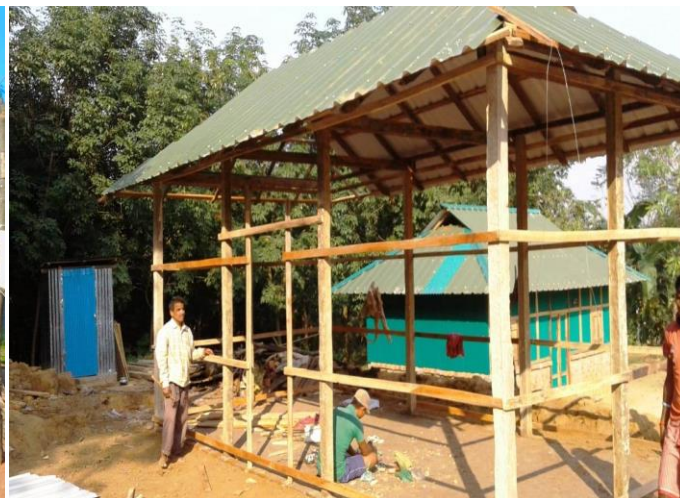
During construction of PMAY-G House